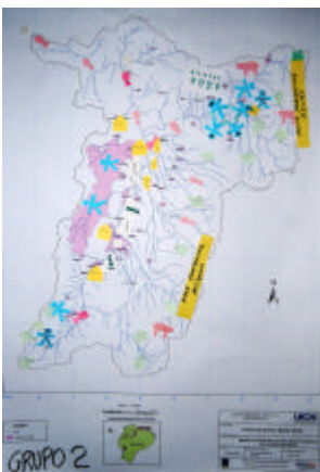
Group work – definition of vision

This multisectorial group made up of more than 60 stakeholders has been working since April 2008. Results of a series of seven workshops of discussion and reflection include: