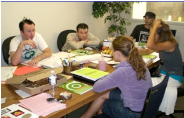
Members of 2006 PJP Partner ALPHA develop a campaign for harm reduction policies in Boise, Idaho

What's more, our staff members bring over 82 collective years of community organizing and training experience to you, steering you clear from common pitfalls in this difficult work.